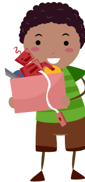
Donating old toys