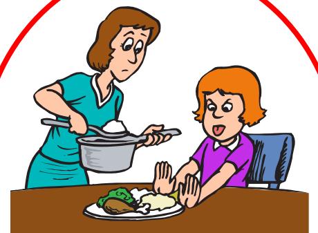
Being a picky eater