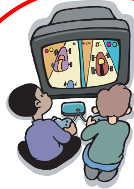
Playing too many video games