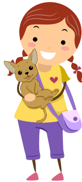
Caring for pets