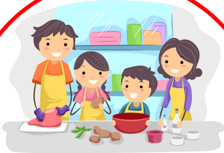
Helping to make dinner

Circle ways you can help different people in your life.