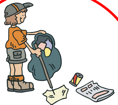
Cleaning up your neighborhood