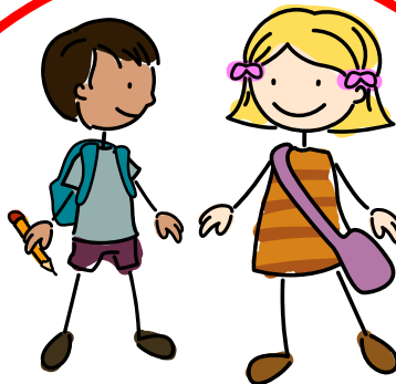
Playing with the new boy or girl at school