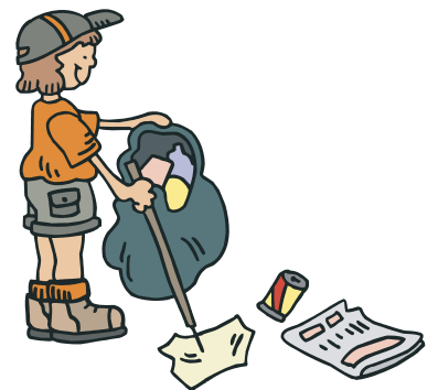
Cleaning up your neighborhood