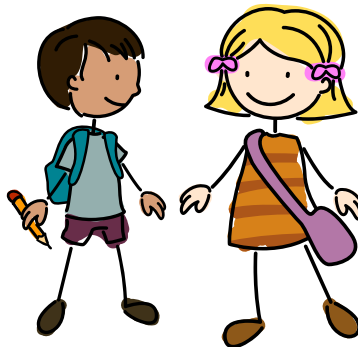
Playing with the new boy or girl at school