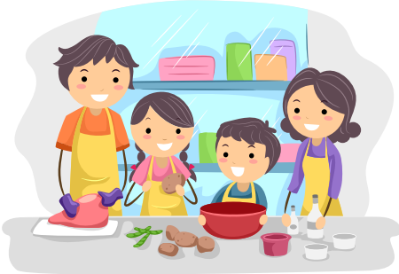
Helping to make dinner

Circle ways you can help different people in your life.