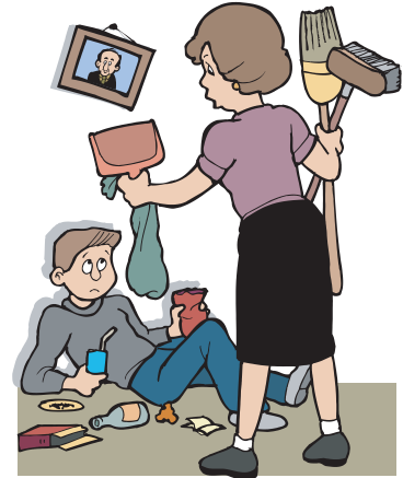
Not cleaning your room