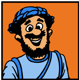
The Good Samaritan