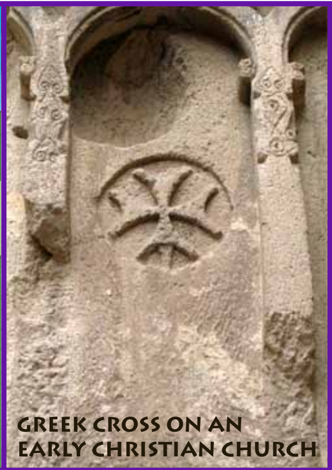
GREEK CROSS ON AN EARLY CHRISTIAN CHURCH

Paul was impressed by the boy, Timothy, and his family in Lystra, and they were impressed with Paul. Paul loved how quickly they learned about Jesus and his teachings, and they loved how quickly Paul recovered from the stoning. In fact, they became Christians during his stay there. After Paul left, Timothy's family helped build a Christian church in Lystra. Timothy became one of its leaders, and was also well known among Christians in nearby Iconium.